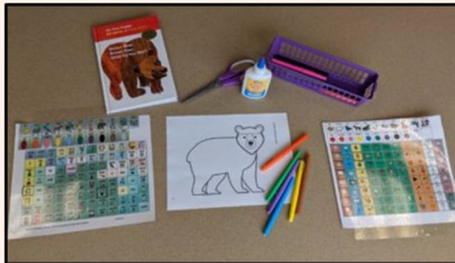
taped to Desk